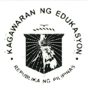
SONNY ANGARA Secretary