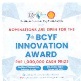
BIA Announcement.png 270K