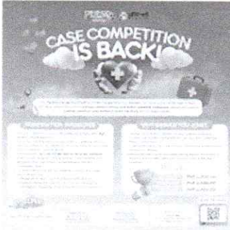
REVISED Case Compets 2024 Registration Pub.png 3411K