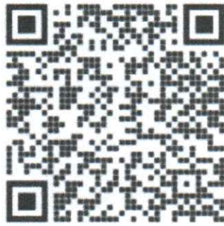
5th BARMM Foundation and 10th Anniversary of January 24 Peace Day