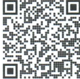
Mindanao Ulama-Bishop Dialogue Meeting and Joint Statement on the December 3, 2023 Mindanao State University-Marawi Bomb