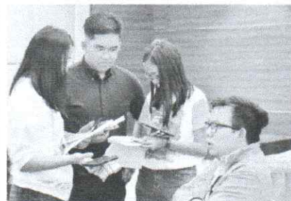
Learn what PH is doing vs. climate change