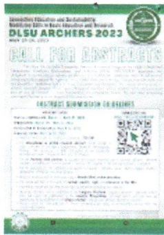
[ARCHERS] CALL FOR ABSTRACTS.png 6553K