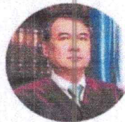
CHIEF JUSTICE ALEXANDER G. GESMUNDO Supreme Court Keynote Speaker