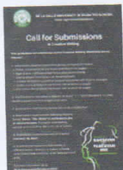
Call for Submission - CW.jpg 2334K