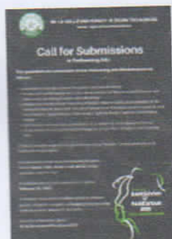
Call for Submission - PA.jpg 2331K