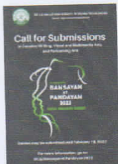
Call for Submissions.jpg 1838K